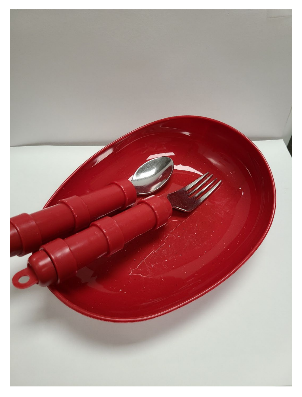
For individuals with Alzheimer's, reduced hand strength and dexterity, arthritis.