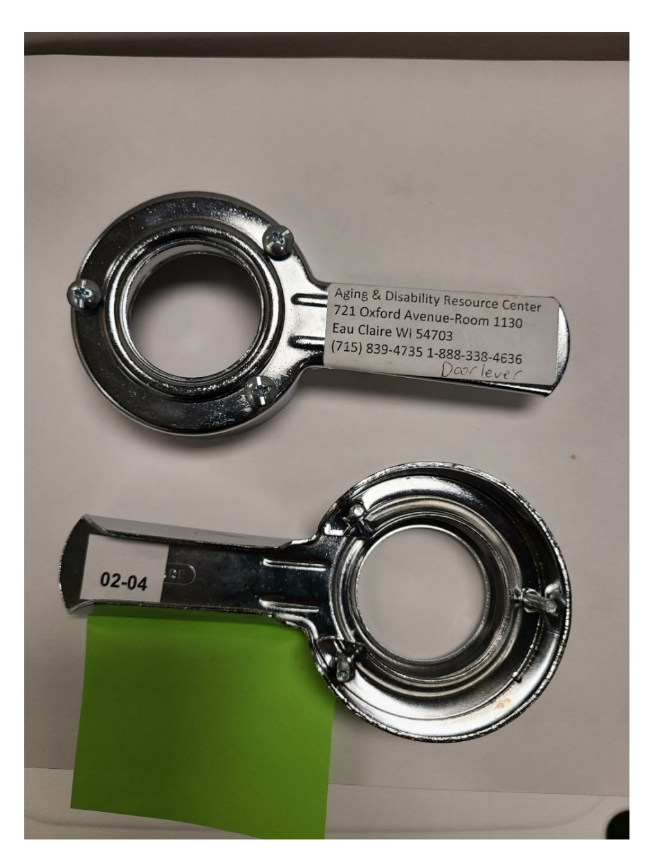
Helpful for those with weakened grip or arthritis. (Requires being screwed into the door)