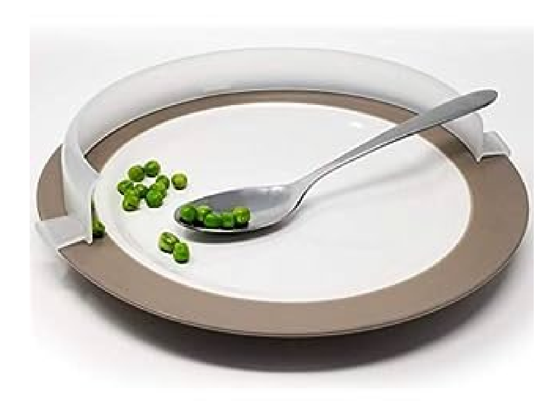
PLATE GUARD/FOOD GUARD

To provide an edge to push food onto utensil and keep food from spilling onto table. Used by individuals with one functioning upper extremity, limited dexterity, tremors, low vision.