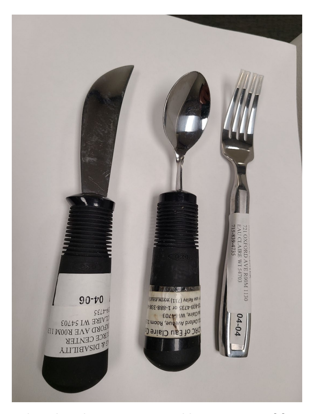
To reduce hand tremors caused by a variety of factors including Parkinsons.