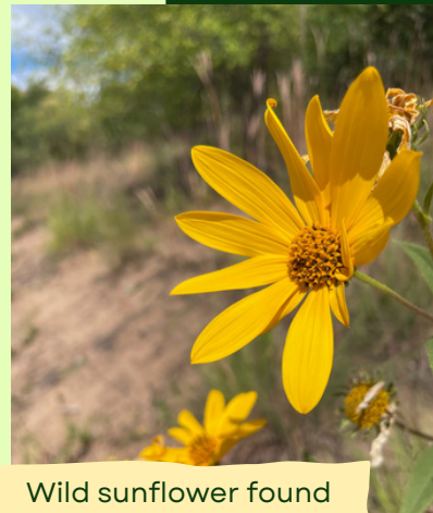
Wild sunflower found on the property.