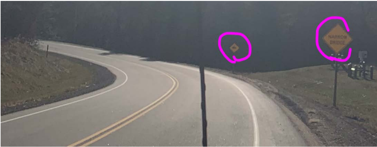
Just South of Eau Claire River Bridge: