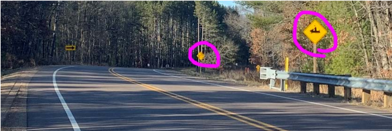
South of Eau Claire River Bridge: