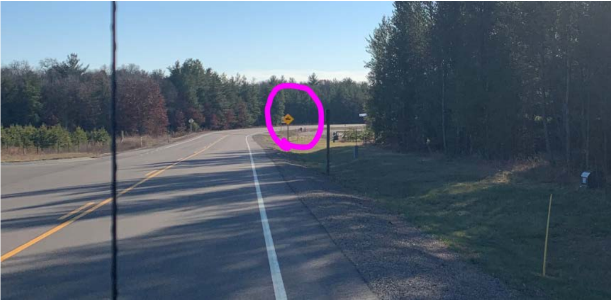
North of Eau Claire River Bridge: