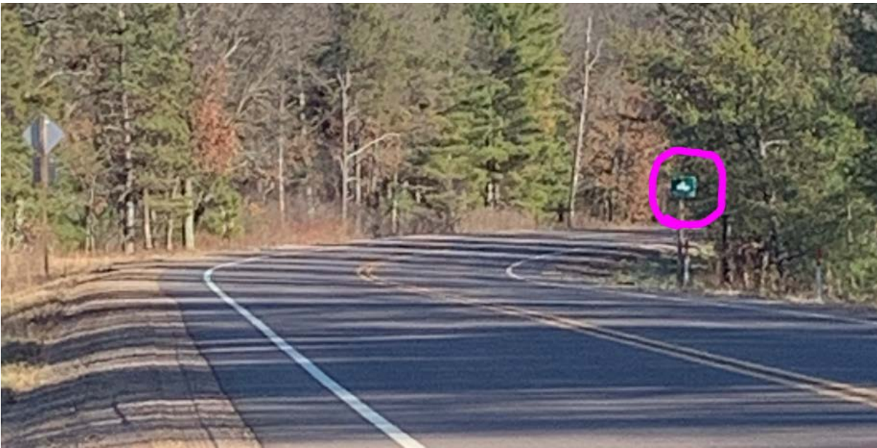
Just North of Eau Claire River Bridge: