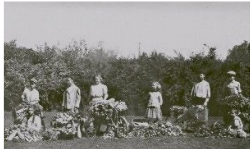
Young people stand outside in back of piles of what appears to be the fruits of an autumn harvest. C. 1920-1929.