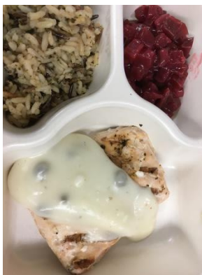
Salmon w/ Lemon Caper Sauce